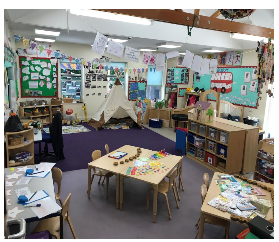
Take a look at all the areas, on the next few pages...