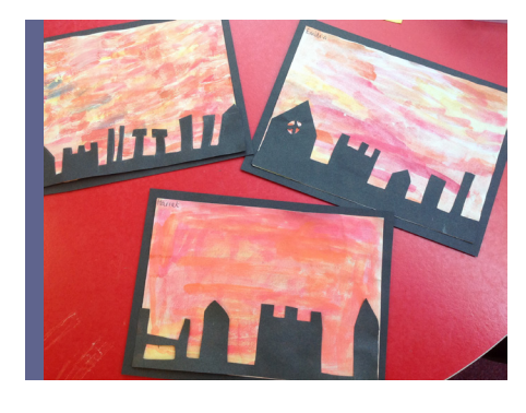
Learning and Living Through Faith

Year 2 we started their new topic on The Great Fire of London. After learning more about what London was like in 1666, in Art they created some fiery night sky silhouettes. They used the medium of watercolour to create the hot, fiery sky then black paper to create the skyline. That part was quite tricky but Year 2 didn't give up! Wonderful creations Year 2 artists.