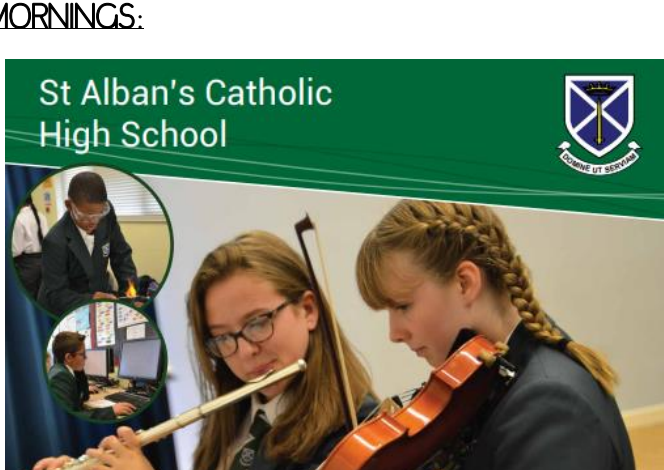
Learning... Respecting... Caring...