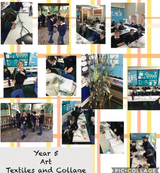
Year 5 Art Textiles and Collage

Using natural materials and inspired by the work of Lesley Richmond, we made woven decorated branches