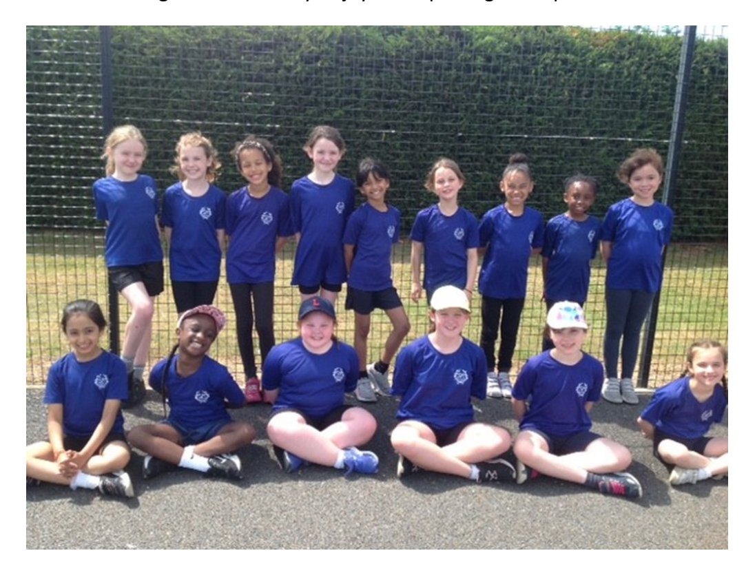
Year 3 Netball

Some of our Year 5 pupils attended the Dodgeball Festival at Inspire in March. They had an amazing time and showed true sportsmanship as they worked hard to get the opposition out. A big thank you to the parents and friends who supported us during the games and helped with transport. Both the children and I agreed—it's always a joy and a privilege to represent our school.