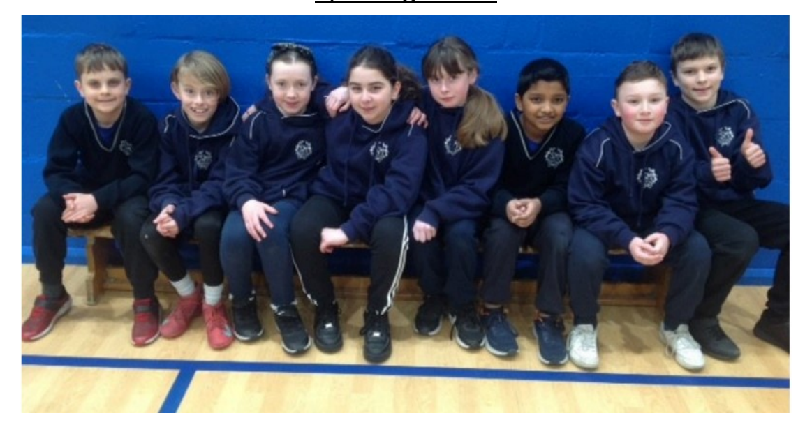
Year 5 Dodgeball

Some of our Year 5 pupils attended the Dodgeball Festival at Inspire in March. They had an amazing time and showed true sportsmanship as they worked hard to get the opposition out. A big thank you to the parents and friends who supported us during the games and helped with transport. Both the children and I agreed—it's always a joy and a privilege to represent our school.