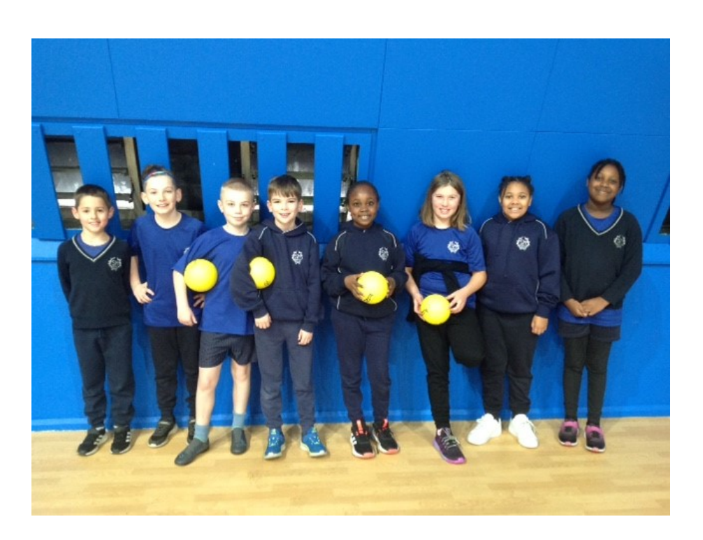
Year 4 Dodgeball

Well done to our team for a fantastic effort during the first match back — especially in the freezing cold! Despite a loss against St John's, the girls showed great determination and improved with every quarter. We celebrated our strengths and thoughtfully reflected on areas for growth, showing a mature and positive attitude toward the game we love to play.